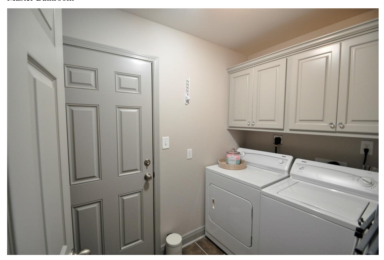
Utility Room that leads to the Garage